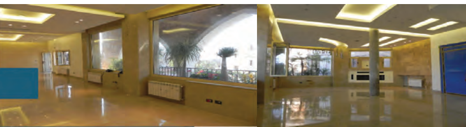
Malek Residence - Mansourieh