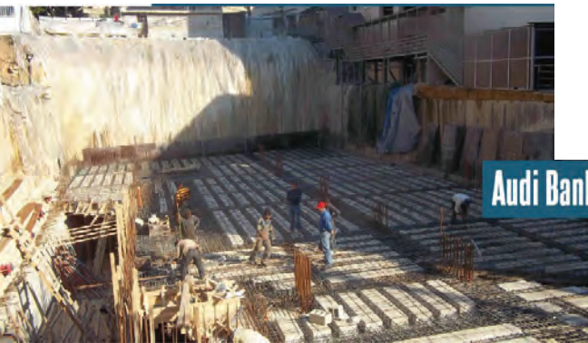
Audi Bank - Hadath

2004-2005 Ramlet El Bayda 4783 - One basement and 11 upper residential floors Project's Built-up Area: 5,500 m2 Concrete quantities: 3,000M3 Awarded Contract: Concrete and civil works. Project's Total Amount: 3 M$