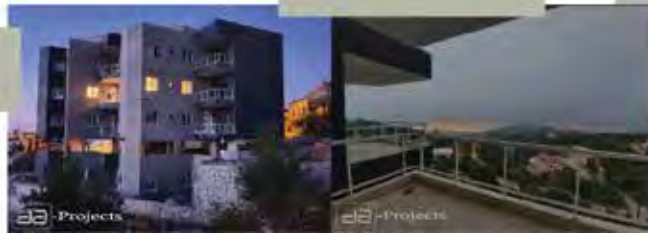
Ras Osta residential building