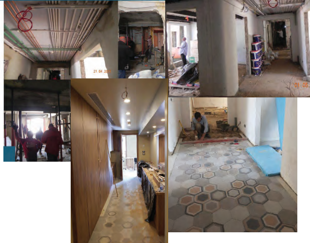
Trad Hospital - Clemenceau